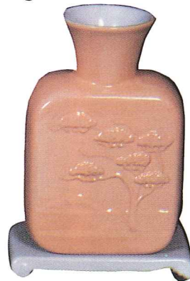
* V-14—PEACH/MTN. HAZE