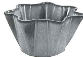
F33—3 3/4 x 7" FLUTED PLANTER