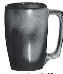
5M—5 1/2" —16 OZ. MUG