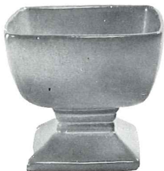
23A—6" SQ. PEDESTALLED VASE