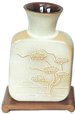
* V-14—DESERT GOLD/COFFEE