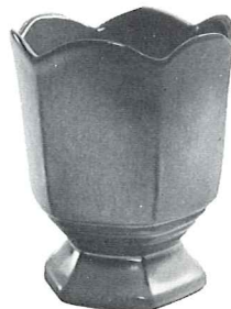
65—6 1/2" HEXAGONAL VASE