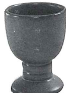
26LC—4 1/2" —6 OZ. TUMBLER VASE