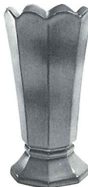
64—9 1/2" OCTAGONAL VASE