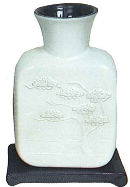
* V-14—WHITE/NAVY BLUE