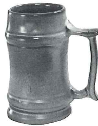
M2—6" —18 OZ. MUG