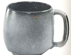
4M—4 1/2" —18 OZ. MUG