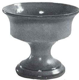
F52—7" PEDESTALLED URN