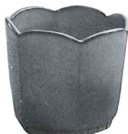
37—4" HEXAGONAL PLANTER