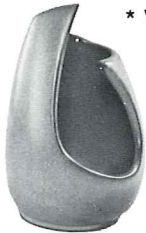
302—6" CANDLE VASE