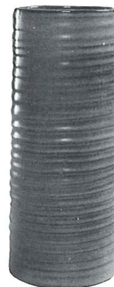
72—10" RINGED CYLINDER VASE