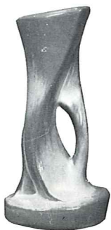
95—8 1/2" FREE FORM VASE