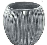
T7—3 1/2" COCONUT PLANTER