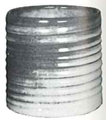
272—4" RINGED CYLINDER VASE

Not Available in Flame. Not Available in Flame.